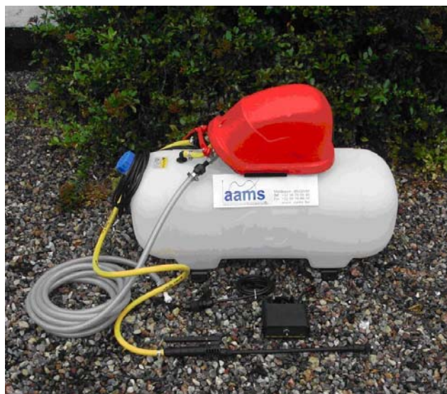
Manufacturers supply kits for sprayer rinsing and cleaning in the field.

Clean water tanks need to be capable of containing enough clean water for internal cleaning and, increasingly, external cleaning too. Typically, their volume is at least 10% of the main tanks capacity. Tank rinsing/sprinklers must be capable of effectively rinsing all the internal structures of the main tank so their design, numbers and fitting location may need to be considered. Most advice, states the need to use the available clean water for internal rinsing, in three distinct cycles rather than in one. New developments suggest that continuous rinsing may be both more effective and make better use of limited water volumes.