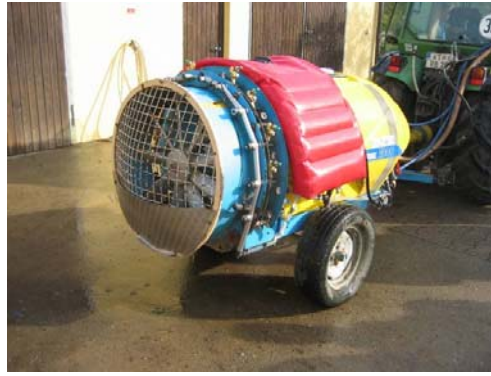
Figure 10. Sprayer equipped with an added auxiliary clear water tank.