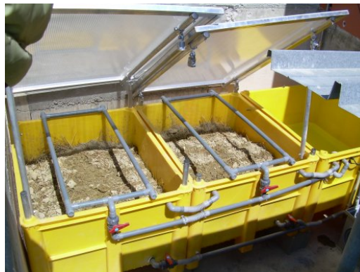
Figure 12. Biofilter installed in Fontanafredda demo farm

Solid and liquid wastes produced at the end of spray applications must be properly managed in order to avoid environmental contamination. For example, empty PPP cans should be collected in dedicated boxes and then delivered to specialised companies for their disposal. The PPP contaminated liquid (originating from spills, overflows, sprayers rinsing procedures, etc.) can be stored in appropriate tanks for delivery to specialised disposal companies or can be treated directly in the farm, for instance using biofilter systems. In this latter case, liquids containing pesticides are poured on farm soil layers (Fig. 12), where the microbial activity degrades PPP active ingredients, allowing to obtain as a final result a “purified” water that can be reused for subsequent treatments.