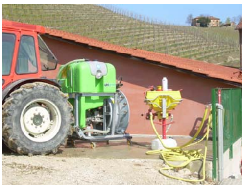
Figure 7. Dedicated paved area for loading and cleaning of sprayers, equipped with a collecting system for PPP contaminated liquids and with an independent induction hopper for loading sprayers.

Moreover, inside the induction hoppers there are rotating nozzles which for cleaning empty PPP cans, allowing to transfer the rinsing water directly in the sprayer tank.