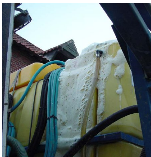
Figure 2. Example of accidental sprayer overflowing.