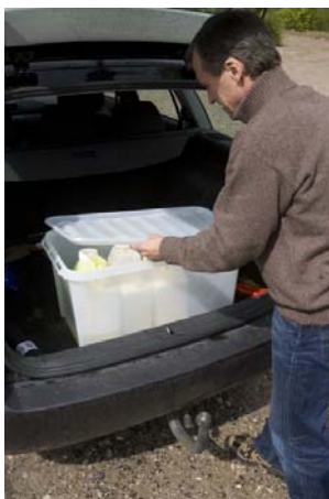
Figure 5. Example of safety box used for PPP transport in a car.

Guidelines concerning the transport of pesticides from the dealer to the farm concern recommendations about the use of adequate vehicles and boxes for transporting pesticides (e.g. van with driver cabin separated from loading area, or boxes for safe transport of PPP cans in the car, Fig. 5), checking of PPP packages integrity, the use of appropriate tools for loading and unloading pallets, the availability of emergency numbers and safety instructions to be used in case of accidents.