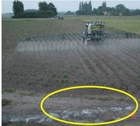
Figure 8. Point source originating from priming operations carried out with the static sprayer.