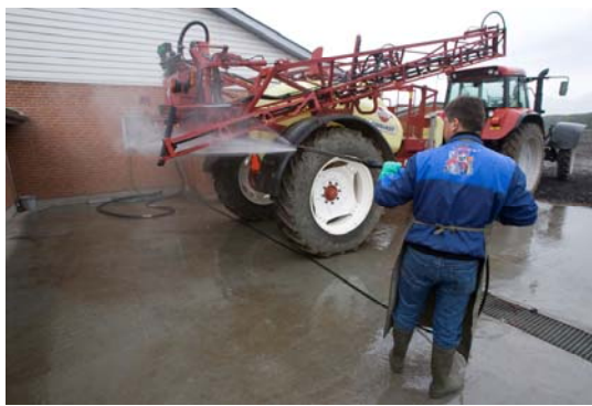
Figure 11. Sprayer cleaning made in the farm on equipped area.