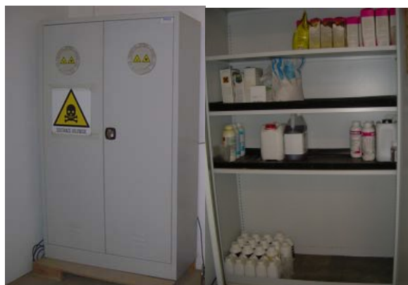
Figure 6. Example of cupboard to store pesticides, with powder displaced over liquids.

PPP have to be stored preferably in a dedicated room, locked and clearly identified with pictograms; the floor of the storage room has to be waterproof and equipped with a system to separately collect accidental chemical losses. If it is not possible to have a dedicated storage room, pesticides at least must be placed in appropriate metallic cupboards (Fig. 6), displacing powders on the top shelves and liquids on the low shelves in order to minimise risks of accidental spills. Absorbent material shall be always available in the storage room, to contain accidental leakages, and a clearly identified tank or can must be present to store PPP contaminated material (e.g. broken cans, absorbent material, etc.).