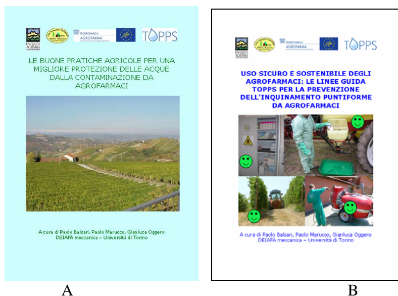
Figure 4. Booklets in Italian language edited by DEIAFA concerning BMP guidelines: A) booklet addressed to farmers; B) booklet addressed to advisors.

In Italy, two illustrated BMP booklets have been issued: one contains only the statements and is addressed to farmers (Fig. 3A), the second contains both statements and specifications and is addressed to advisors and experts. (Fig. 3B).